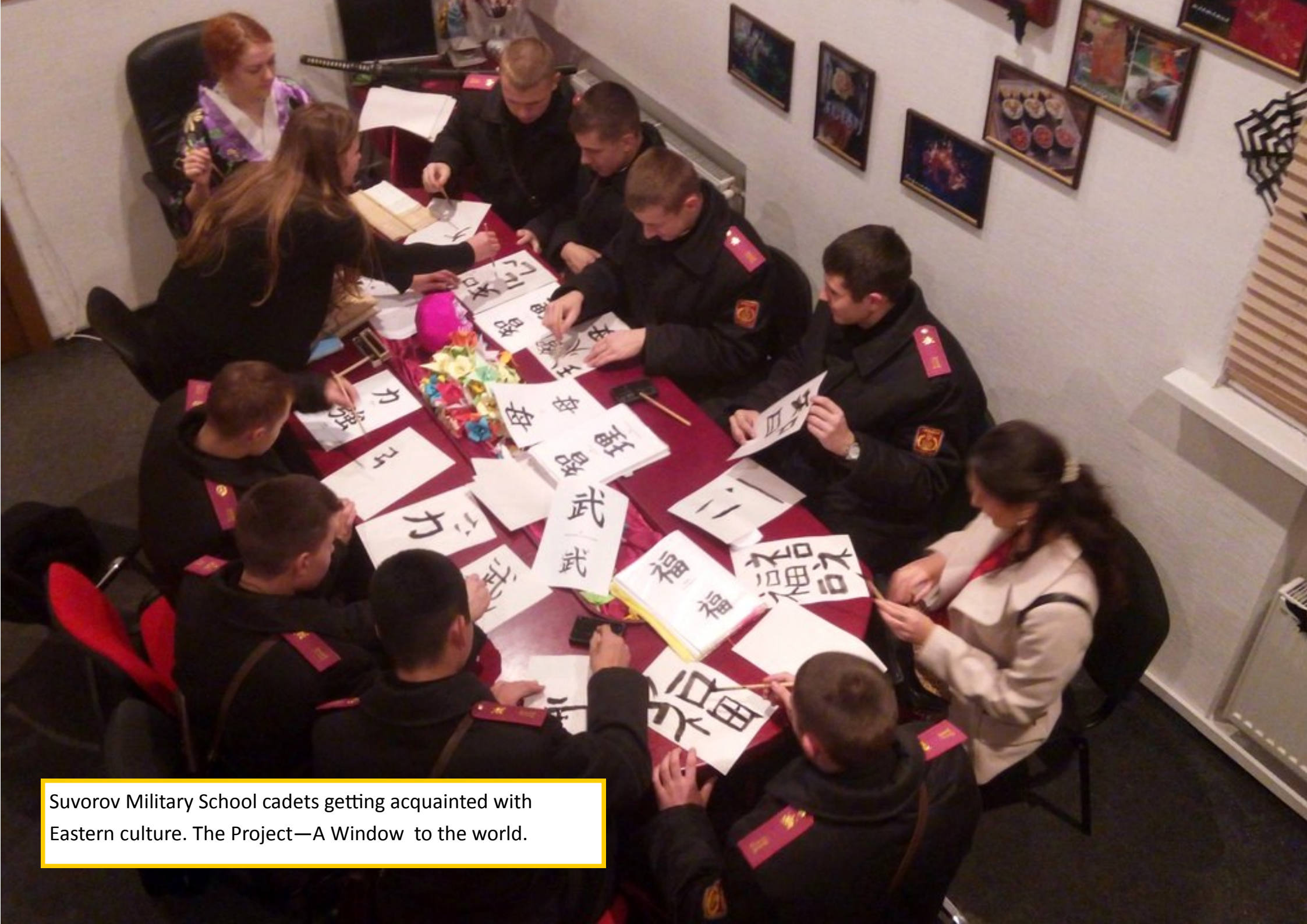
Suvorov Military School cadets getting acquainted with Eastern culture. The Project—A Window to the world.