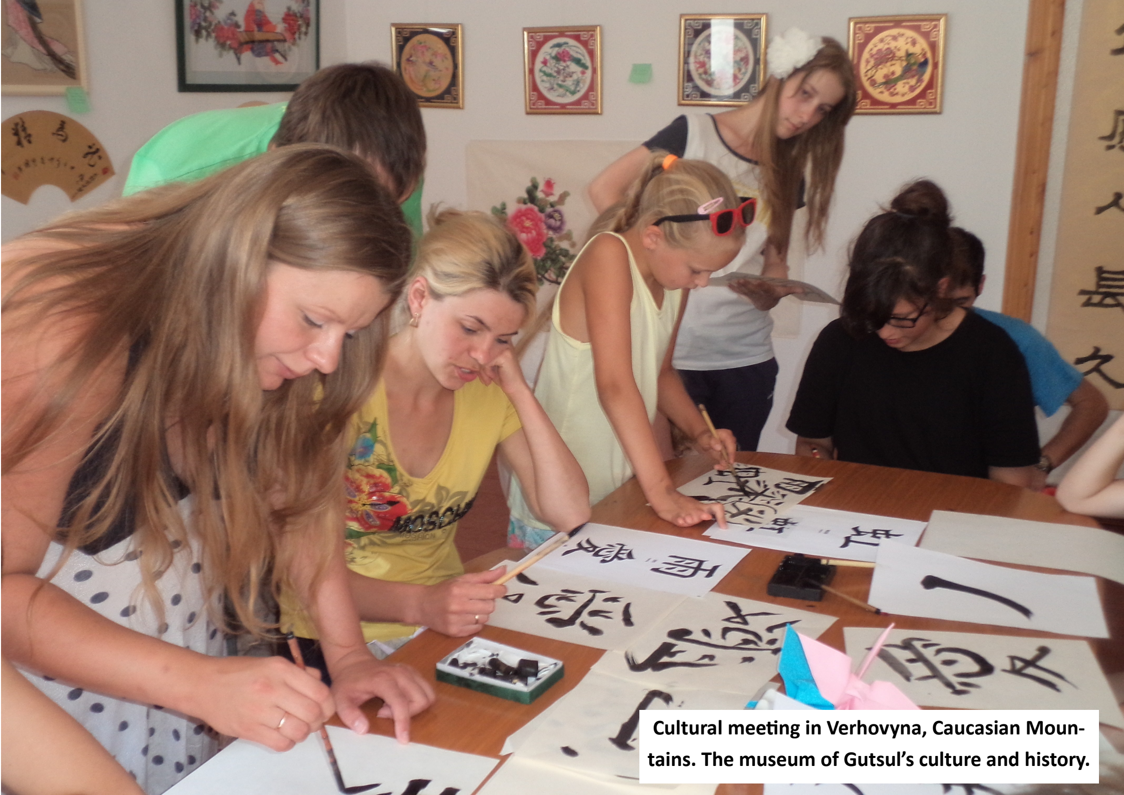
Cultural meeting in Verhovyna, Caucasian Mountains. The museum of Gutsul's culture and history.