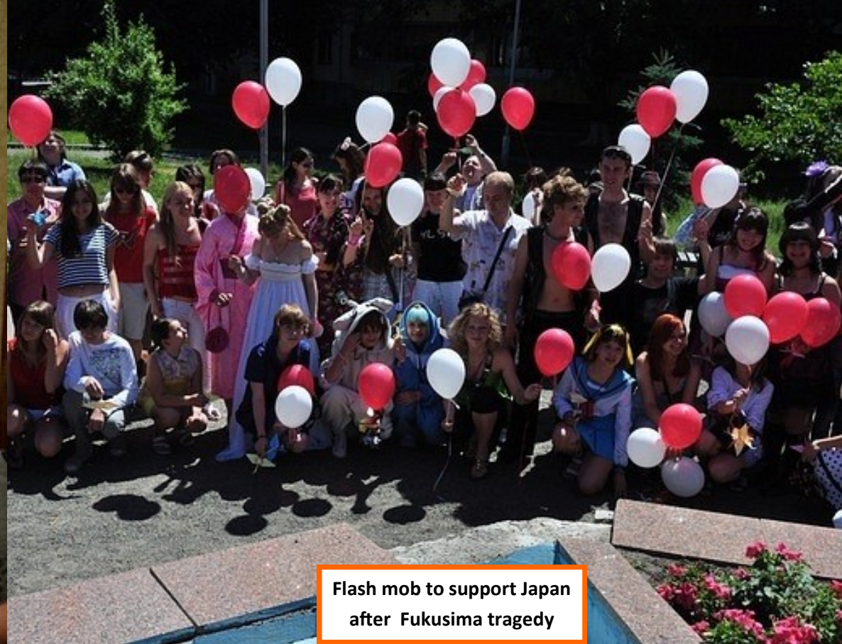
Flash mob to support Japan after Fukushima tragedy