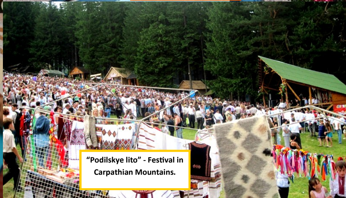
"Podilskye lito" - Festival in Carpathian Mountains.