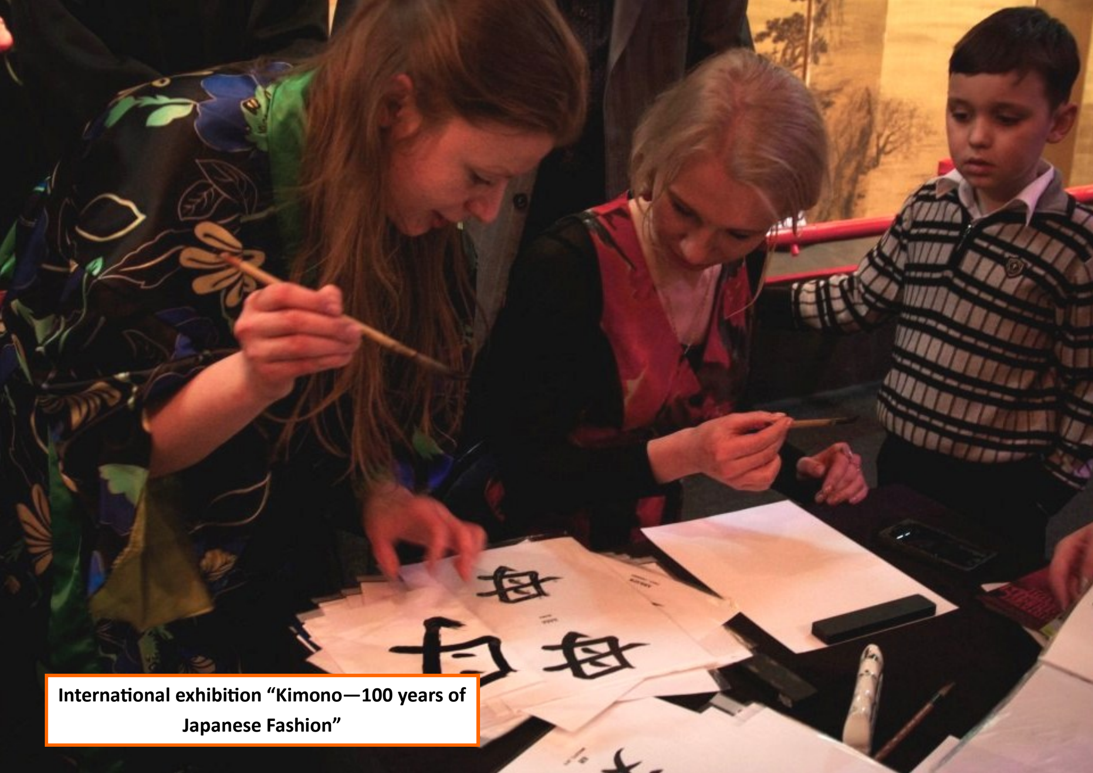
International exhibition “Kimono—100 years of Japanese Fashion”