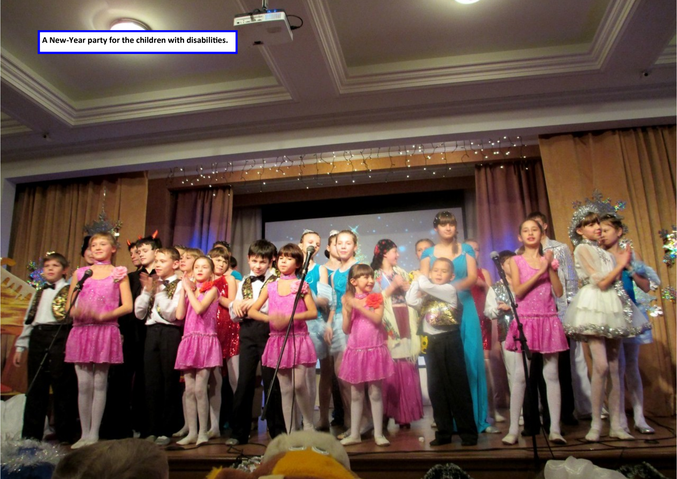
A New-Year party for the children with disabilities.