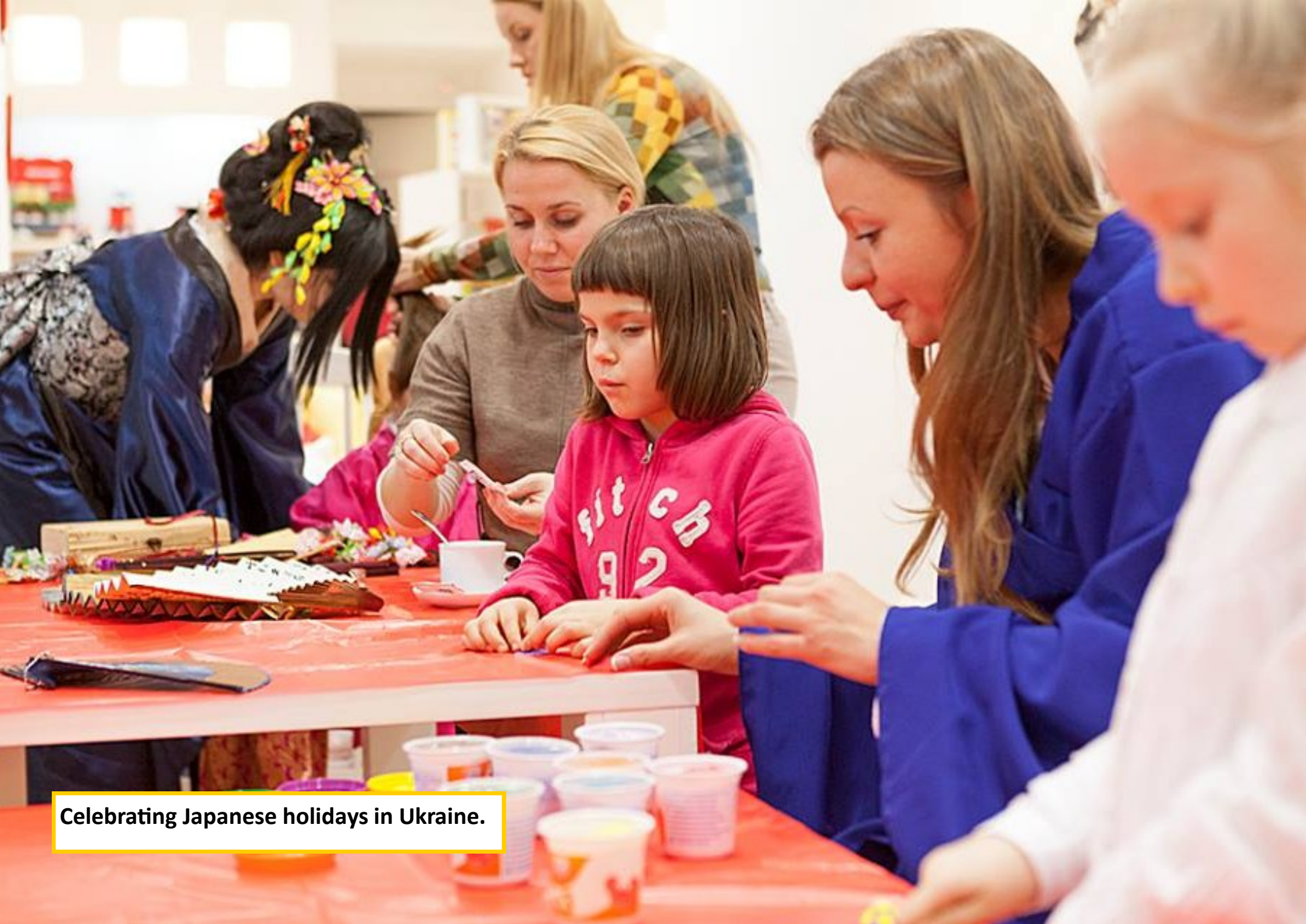
Celebrating Japanese holidays in Ukraine.